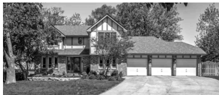
$350,000 16512 Frederick Circle