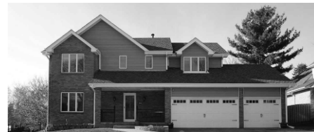
$279,000 16555 Ontario Circle