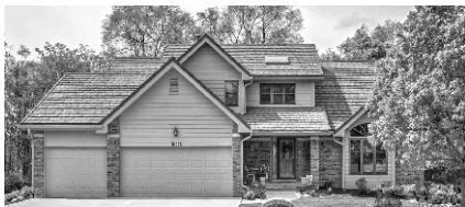
$437,000 16597 Hascall Street