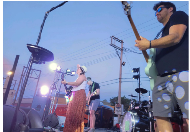
July 13: eNVy